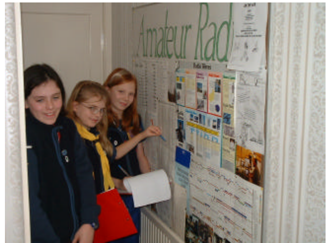
Guides looking for requested information.